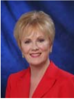
Congresswoman Kay Granger

Kay Granger is the Congresswoman for the 12th District of Texas. She is the only Republican woman from Texas to serve in the U.S. House of Representatives. Long active in local, state and national government as well as civic affairs, Congresswoman Granger is recognized for her energetic and sensible leadership.